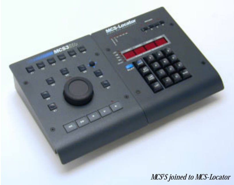
MCS 3 S joined to MCS-Locator

Before you begin, you should decide which side of the MCS-Locator will be mounted to the MCS 3 . You may place it on the left or right side depending on preference.